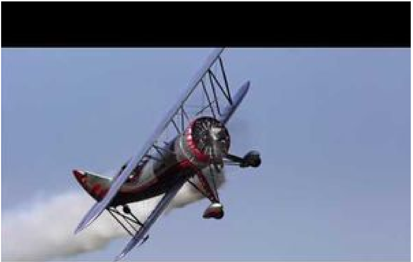
Immortals - Airshow 22 hrs ago

Reporter Winona Whitaker can be contacted at wwhitaker@ottumwacourier.com and followed on Twitter @courierwinona.